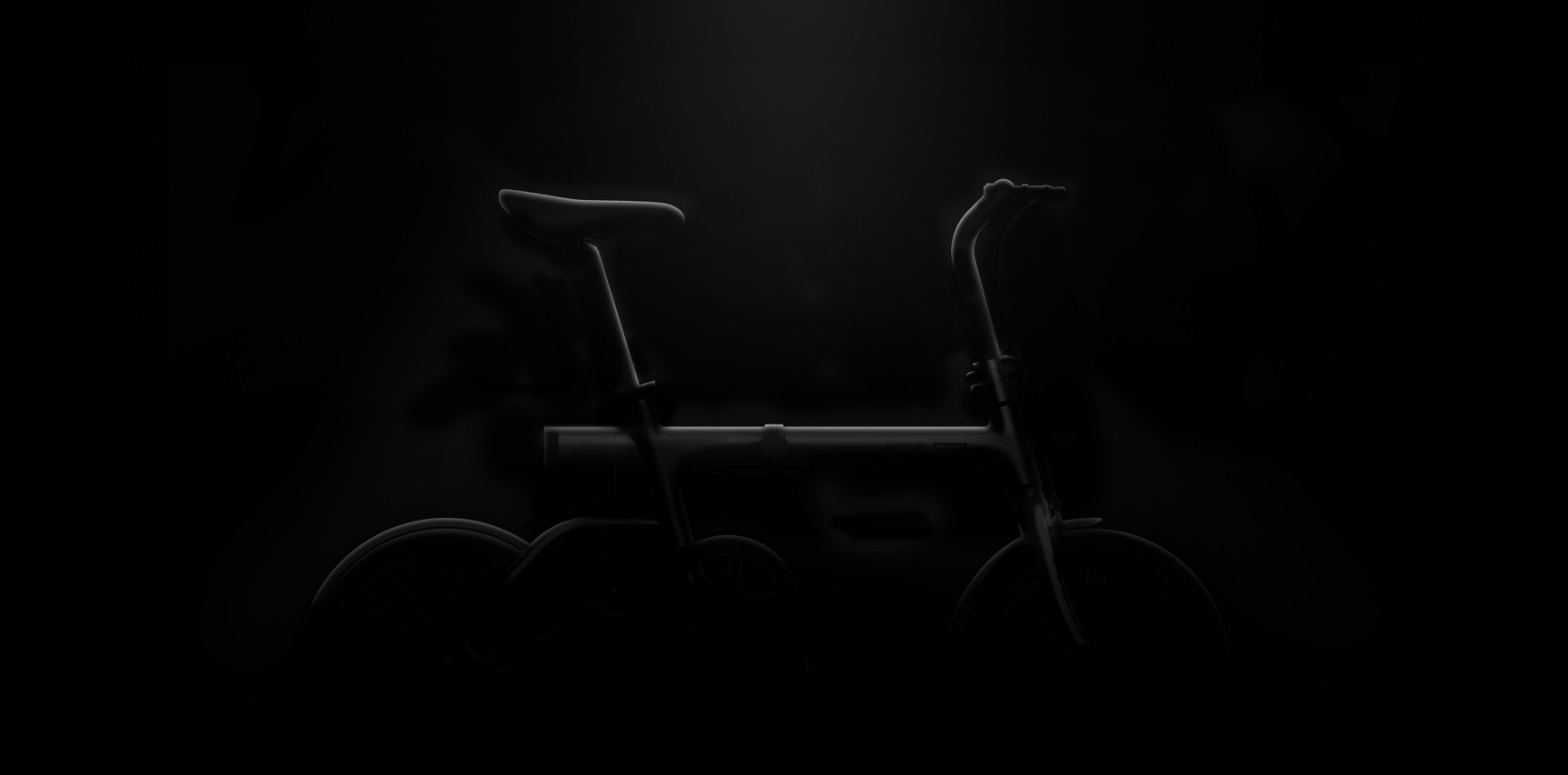
The Future Of The Bicycle